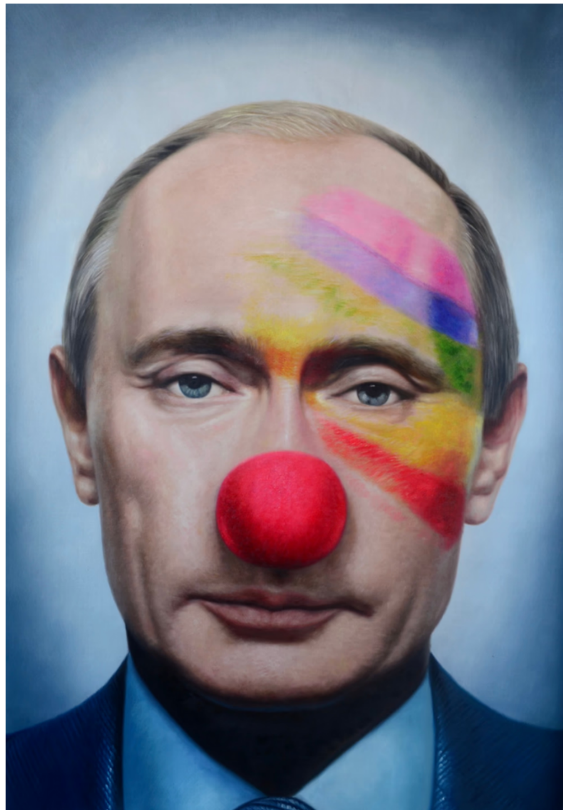
Sad Clown Edition of 1 NFT and Painting 4' 3" x 35.5" 8.500 USD