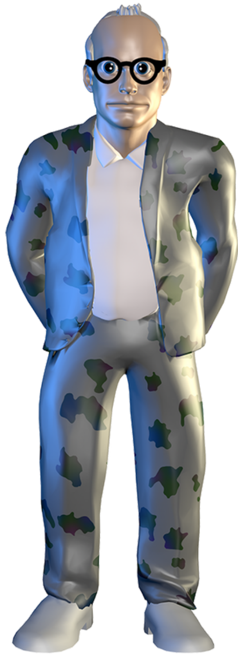
Pop Principle: The Sculptures (Hans Ulrich Obrist) Editions of 3 Resin ABS 4' 4" x 21.5" 8.500 USD