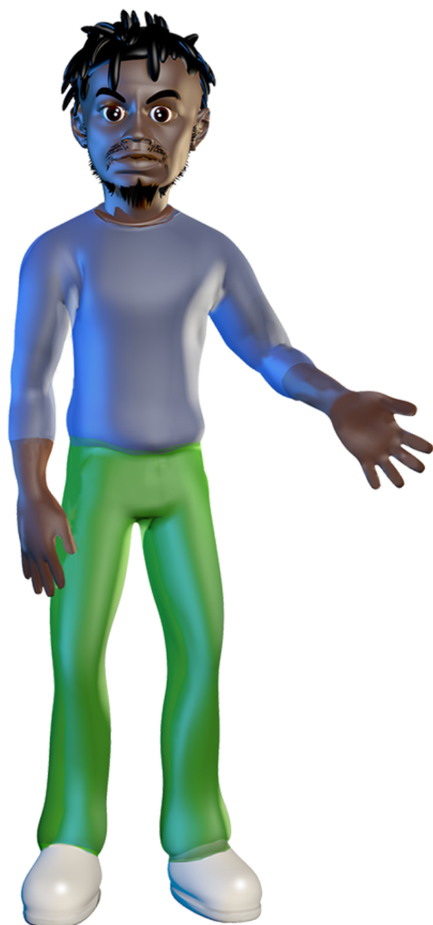
Pop Principle: The Sculptures (Osinachi) Editions of 3 Resin ABS 4' 6" x 16" 8.500 USD