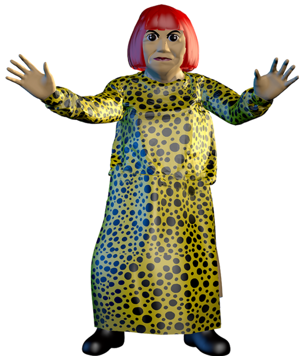
Pop Principle: The Sculptures (Yayoi Kusama) Editions of 3 Resin ABS 3' 6" x 19" 8.500 USD