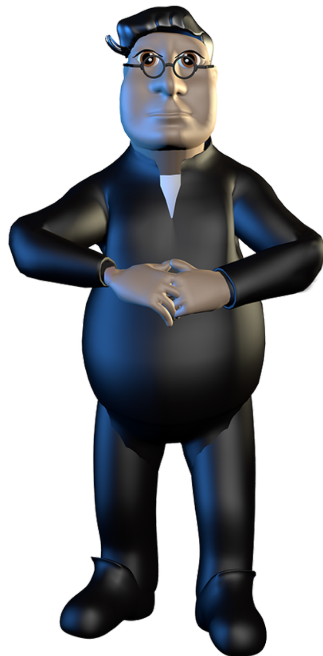
Pop Principle: The Sculptures (Refik Anadol) Editions of 3 Resin ABS 3' 11" x 19.5" 8.500 USD