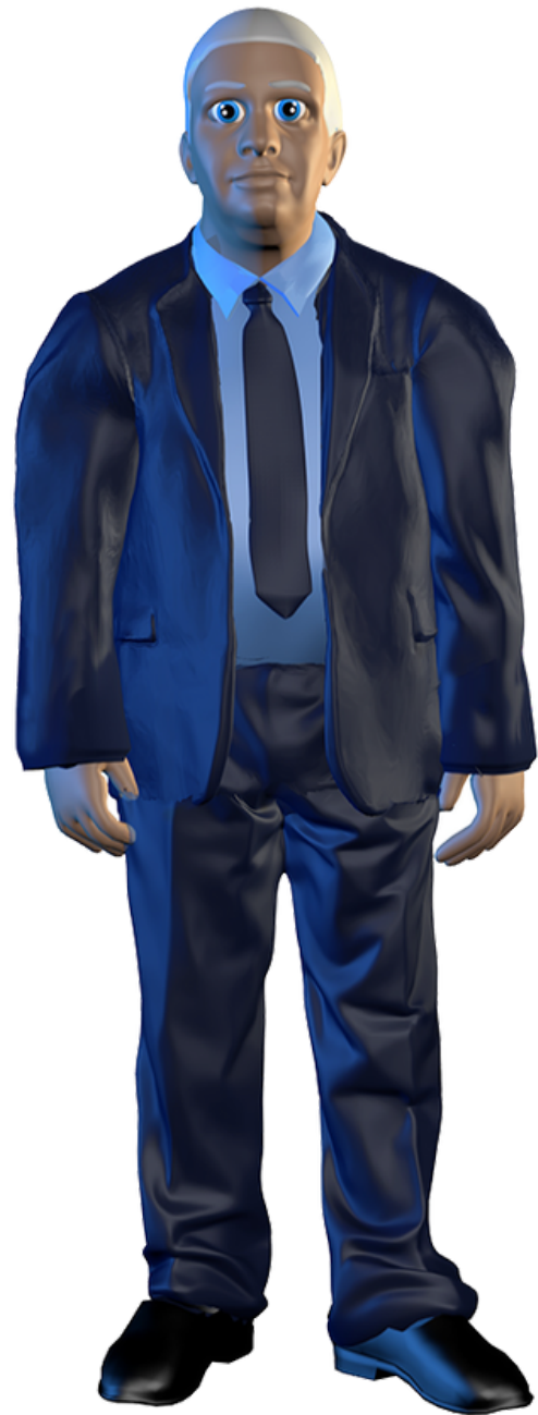
Pop Principle: The Sculptures (Larry G) Editions of 3 Resin ABS 4' 9" x 14" 8.500 USD