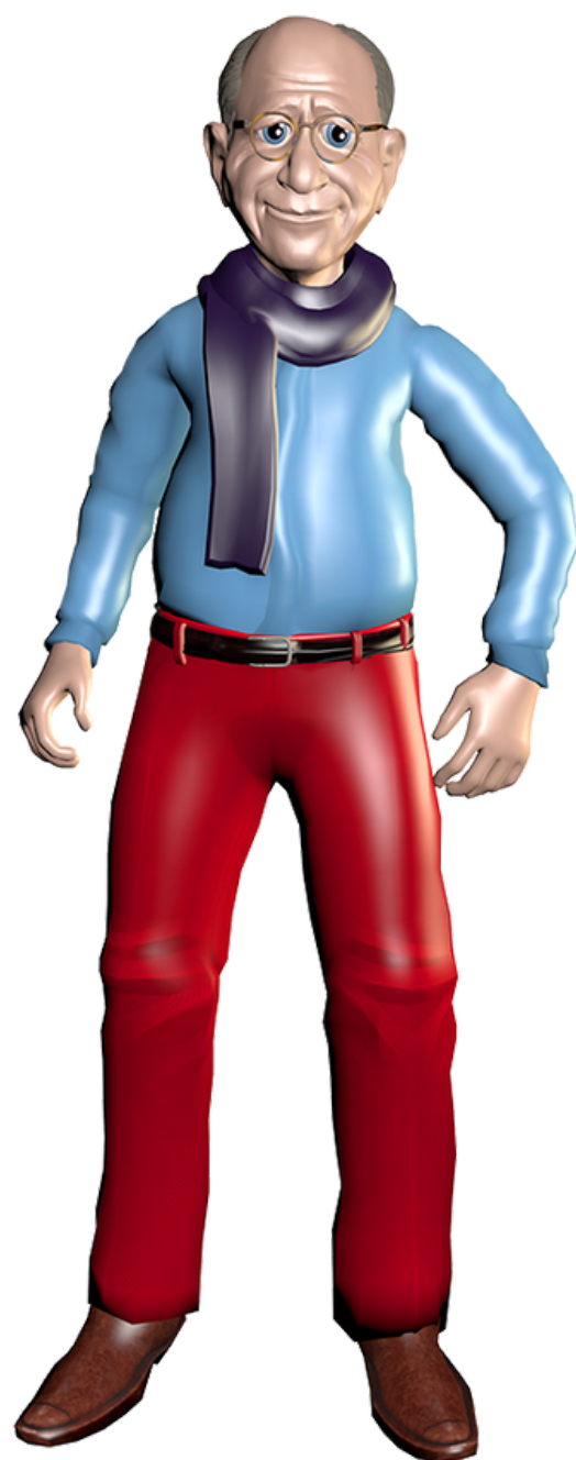
Pop Principle: The Sculptures (Jerry) Editions of 3 Resin ABS 4' x 12" 8.500 USD