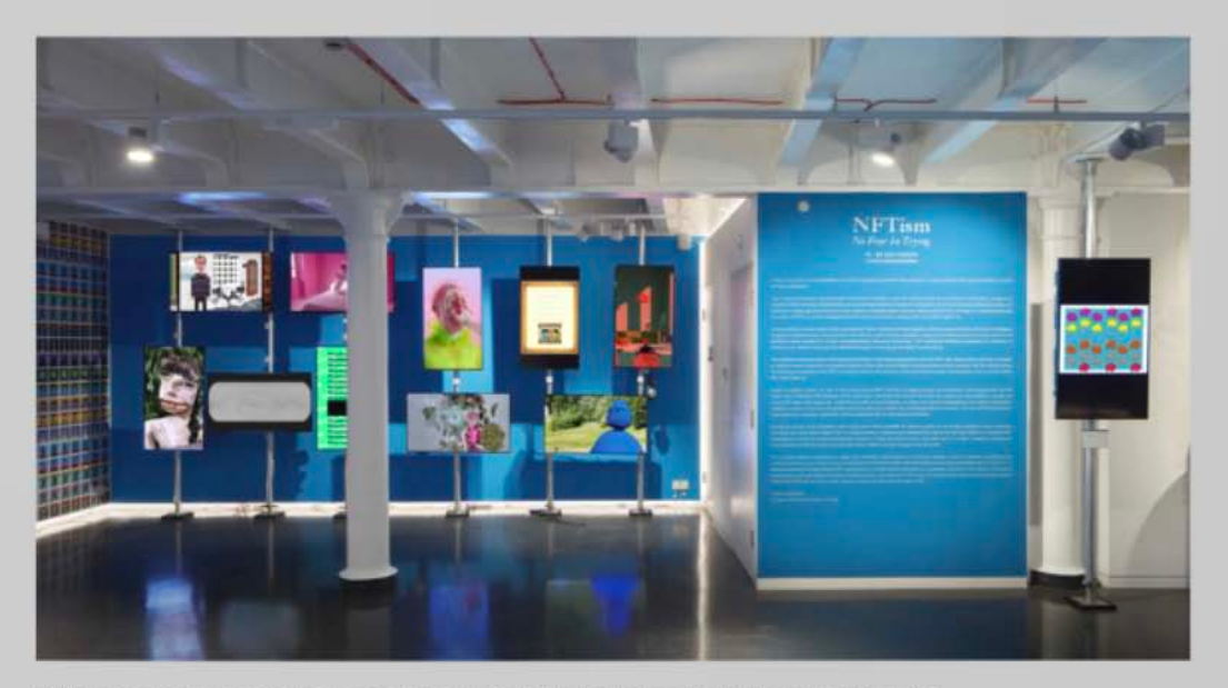
"NFTism: No Fear in Trying", historic NFT group exhibition curated by Kenny Schachter with Unit London at Covent Garden, The Stables.

I am beyond grateful and appreciative. That's a place for everyone, and that is what makes it so revolutionary—it's nothing short of that!