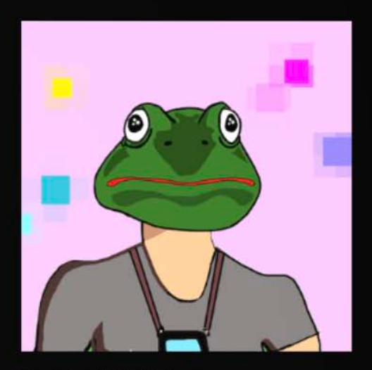
"CryptoMutts #6393"